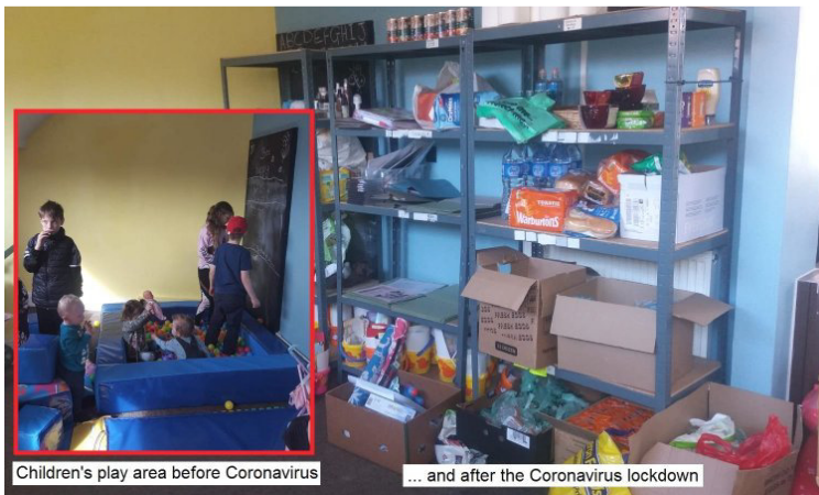
Gateway Community Care Hub Withernsea

Due to Coronavirus Gateway and Kingstrust Network urgently needs your help. We're a small charity and most of our funding comes from sales from our shops in Withernsea and Filey. We have been slowly moving over to other fundraising streams like grants but we've been caught out as many have by the Coronavirus pandemic.