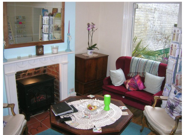
Gateway drop in centre Filey

Since our shops are in seaside towns we are normally very short of money at this time of year (March), because seaside towns largely shut down for the months of January through March. For this reason the Coronavirus pandemic has hit us extra hard coming just at our seasonal low point. Our income, instead of rising, has fallen to zero with both shops now closed. There are things that we bought to sell at Easter, that will now not be sold, but we still have to pay for them.